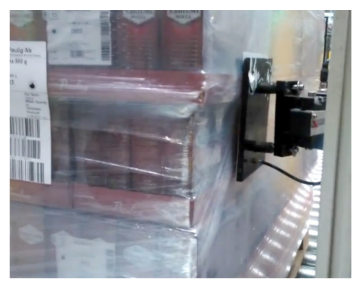
Microscan's QX-870 Raster Laser Scanner validates the barcode on the pallet label immediately after it is printed.

■ Project: Barcode scanning solution for pallet label validation at Paulig Coffee.